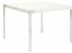
n. 1 WHITE TABLE 70x70x72H